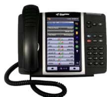
Color Touch Screen LCD Phone