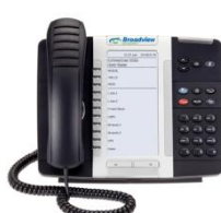
Backlit LCD 24-Key Phone