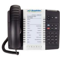
Backlit LCD 48-Key Phone