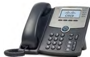
SPA504G - 4 Line Phone

Lease to Own available on this model for only $4.95 a month for 2 years