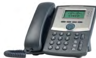
SPA 303 - 3 Line Phone

Do you need Handsets? We've got you covered.